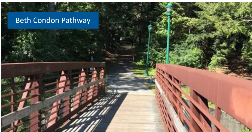
Beth Condon Pathway

Beth Condon Pathway (1.7 Miles, Completed). This existing pathway runs through Royal River Park and downtown Yarmouth and completes the Casco Bay Trail loop. The pathway is named in honor of a Yarmouth student who was struck by a drunk driver while walking along US Route 1.